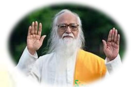
Kayakalpa Yoga ArivuThirukovil, Temple of Consciousness, Aliyar