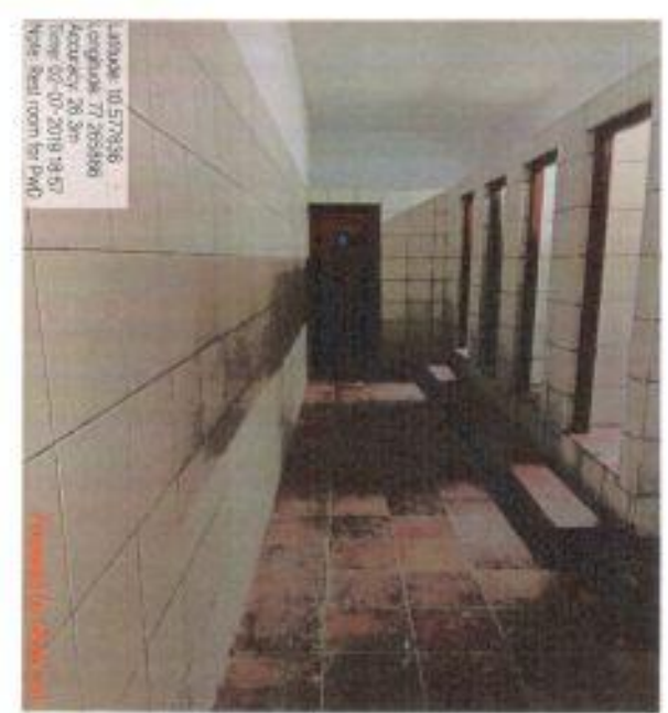
Ramps in Various Blocks