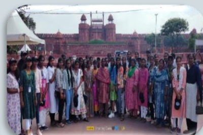
UNION- EDUCATIONAL TOUR TO NEW DELHI