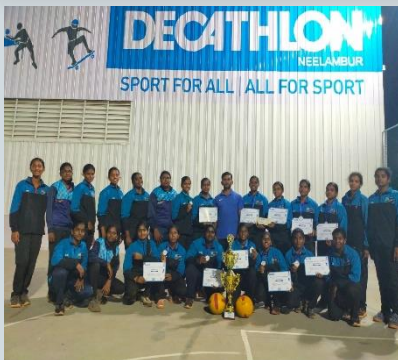
GVGVC THROWBALL TEAM