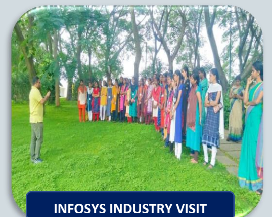
INFOSYS INDUSTRY VISIT