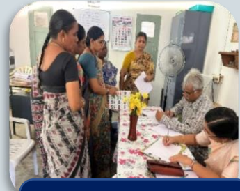
ACADEMIC & ADMINISTRATIVE AUDIT-04.05.24