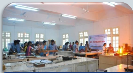
DBT ACTIVITY IN PHYSICS LAB-04.01.24