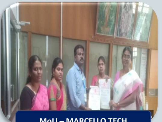
MoU – MARCELLO TECH