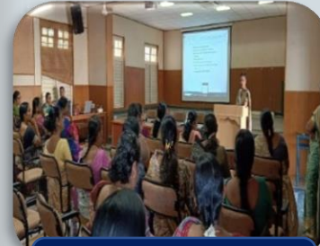
NAAC ORIENTATION PROGRAMME