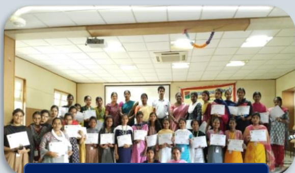
NATIONAL WORKSHOP – 26.02.24