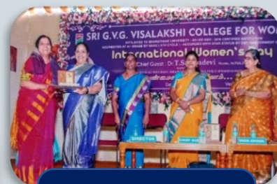
INTERNATIONAL WOMEN'S DAY- HONOURING ALUMNI