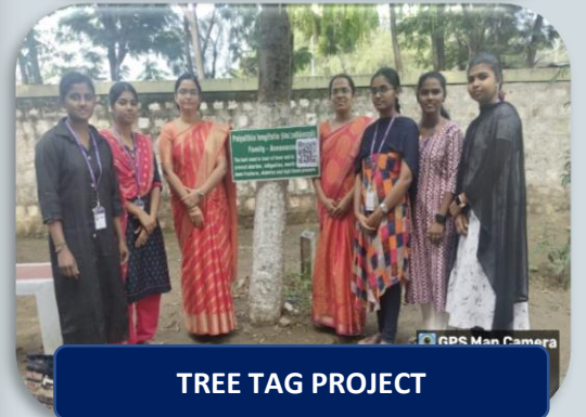
TREE TAG PROJECT