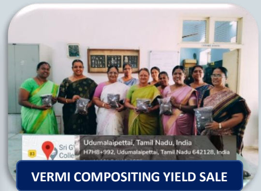
VERMI COMPOSTING YIELD SALE