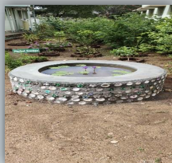
ECO BRICK LILY POND