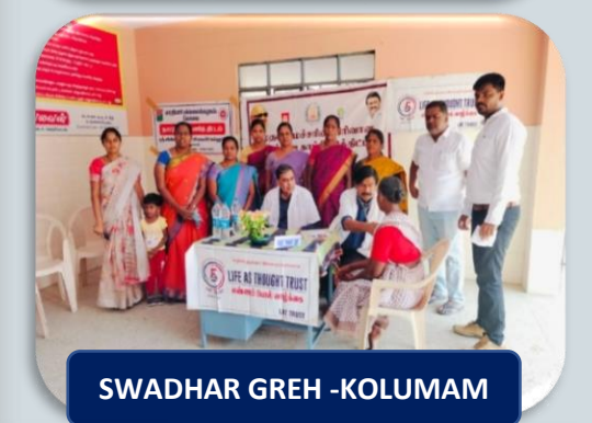
SWADHAR GREH -KOLUMAM