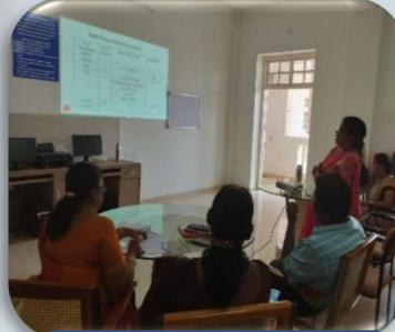
IQAC ANNUAL MEETING-03.05.24