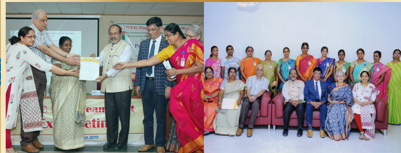
PEER TEAM VISIT- 26 th and 27 th March 2019