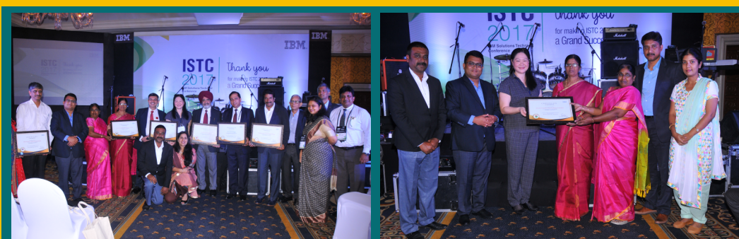
IBM Appreciation Awards (2017)