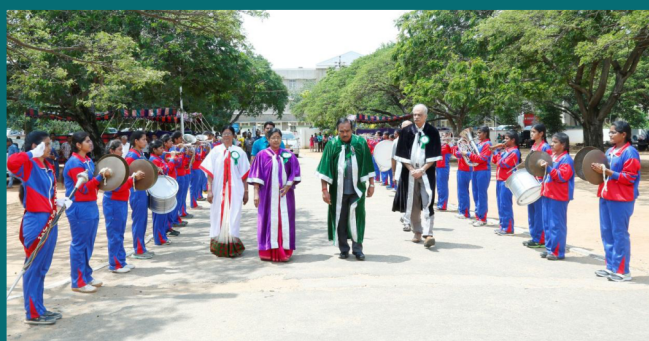
The Guest of Honour