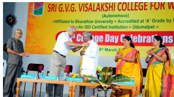
COLLEGE DAY HONOURING THE CHIEF GUEST