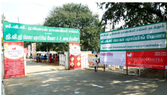
MEGA SHOPPING MELA