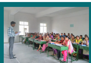
On –Campus drive