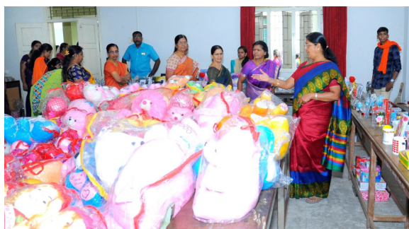
SALES DAY-NOT FOR EXHIBIT BUT FOR SALE