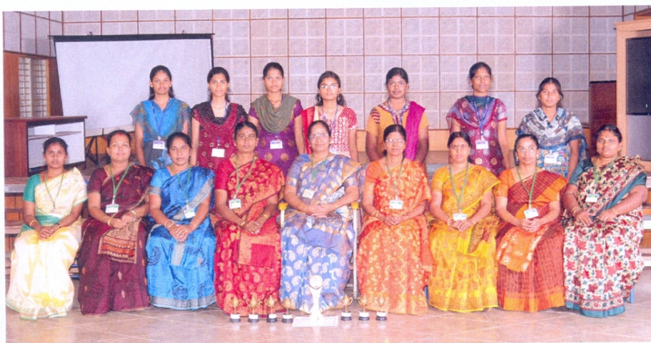
Overall shield in the inter collegiate competition