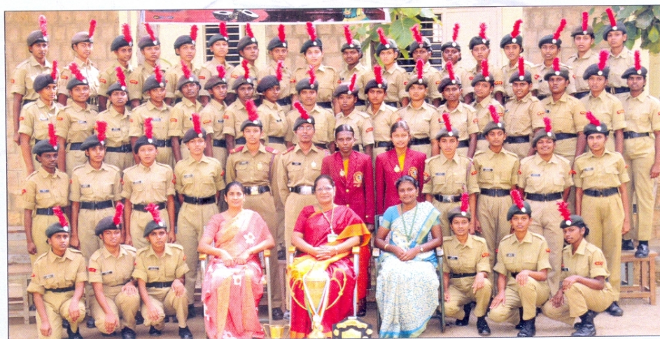
An iron fist with the feather touch - Our NCC Cadets