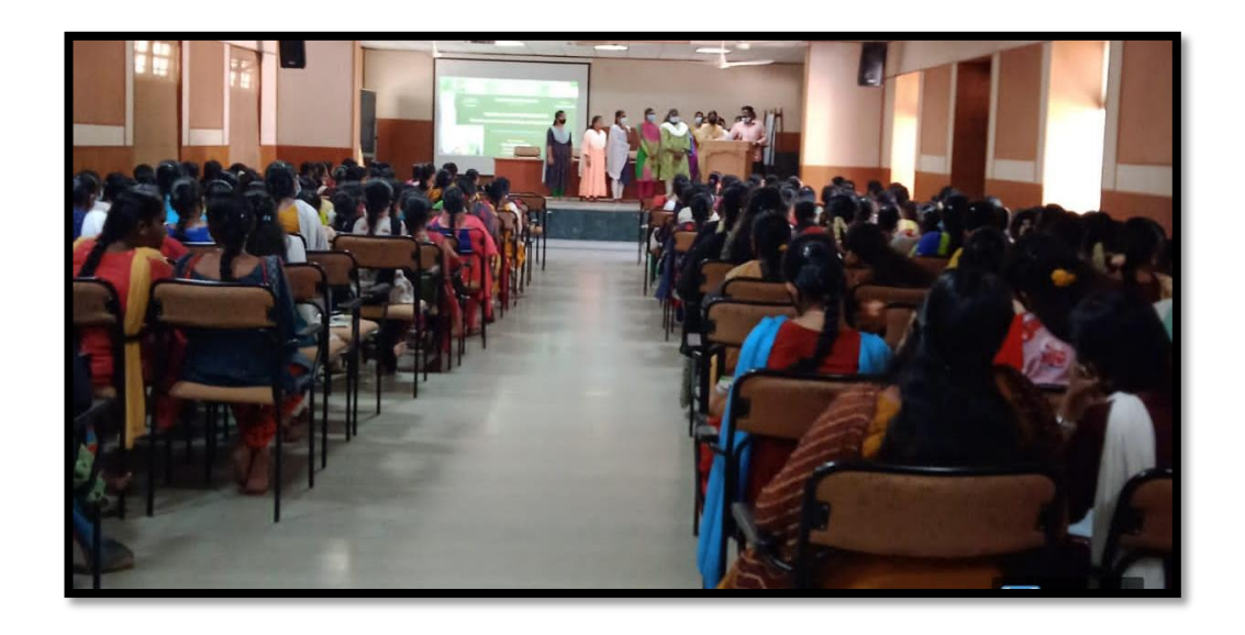
Upcycling Pet Bottle into Planter (Demonstration)