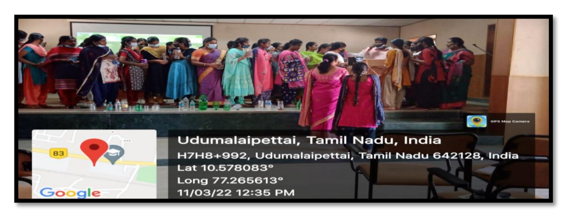
Pet Bottle with Coco-peat (Grow Coins) seed sown on it