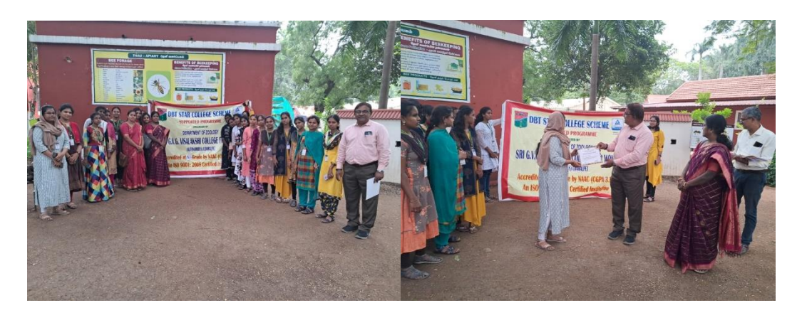
Students Visited Museum