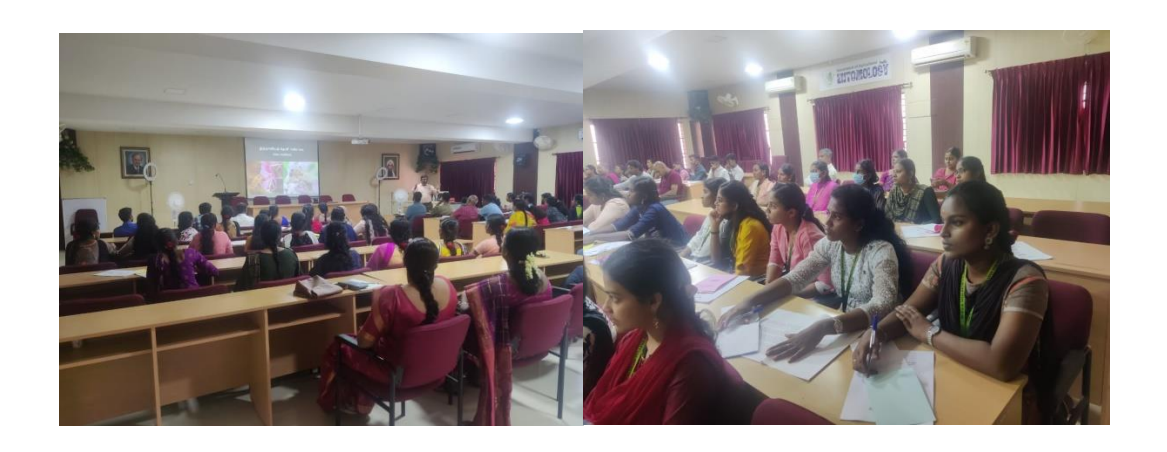
Practical Explanation to the students by Department staff to the students