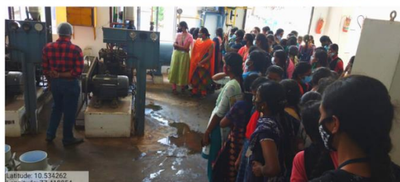
Industrial Visit to KSE and Vesta Ice-creams on 20-12-2021.