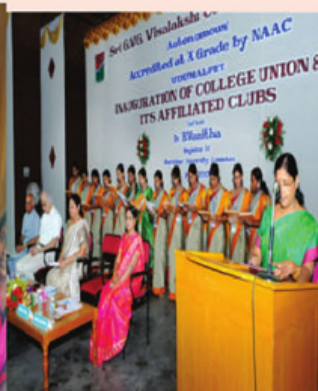
DELEGATION OF RESPONSIBILITY - OATH TAKING BY THE OFFICE BEARERS