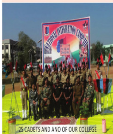
25 CADETS AND ANO OF OUR COLLEGE IN DARJEELING CAMP, SIKKIM