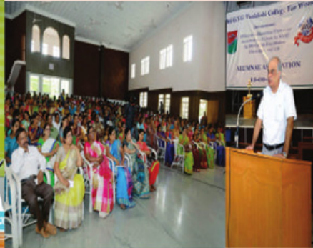
ENTHUSIASTIC AND ENLIGHTENED PARENTS AT PTA MEETING