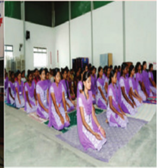
A NATURAL LIFE STYLE EXPERIENCE