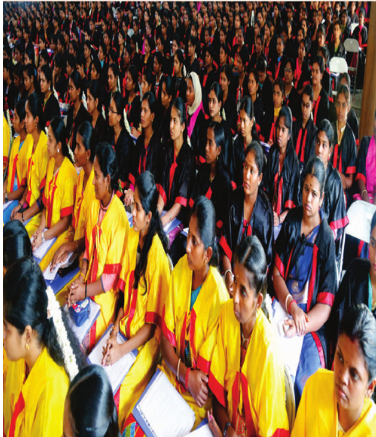
Inspire high vision of lead india-2020 & Dream comes true-empowered degree holders