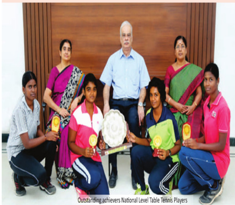
Outstanding achievers National Level Table Tennis Players