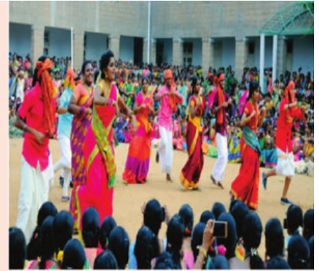
EBULLIENT PONGAL FESTIVAL