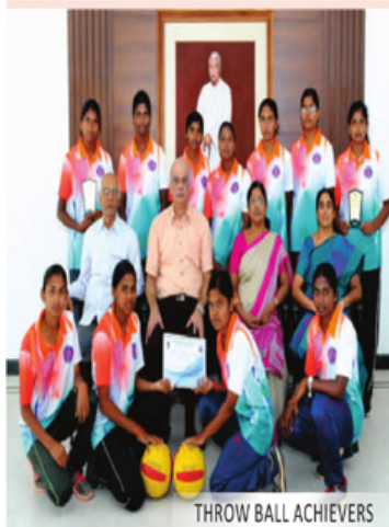
THROW BALL ACHIEVERS