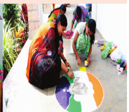
A BONANZA OF COLOURFUL FEST