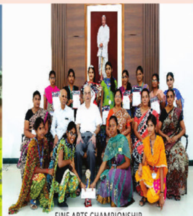
FINE ARTS CHAMPIONSHIP