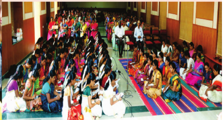
INCULCATING THE VALUES OF CHANTING MANTRAS-SPIRIT OF SPIRITUALITY- BAJANS ON FOUNDER'S BIRTHDAY CELEBRATION